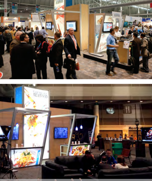
hey took 20' of the exhibit to Super Bowl XLVIII

"...We were able to feature more products, interact with more buyers, gather more leads and make the splash we wanted.